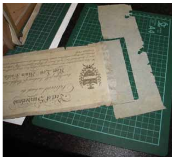
Figure 4. Making a new guard. We were extraordinarily lucky that Tim Gradon had a small stock of the identical type of sugar-bag paper of which the books pages were made. This had come to his workshop forming the publisher's loose covers of unbound issues of early 19th century copies of Newcastle Magazine which the owner had sent for binding. There was no printing on the backs of these covers, so new guards were simply cut from them and pasted to the damaged pages. These repairs were virtually invisible in the finished book.