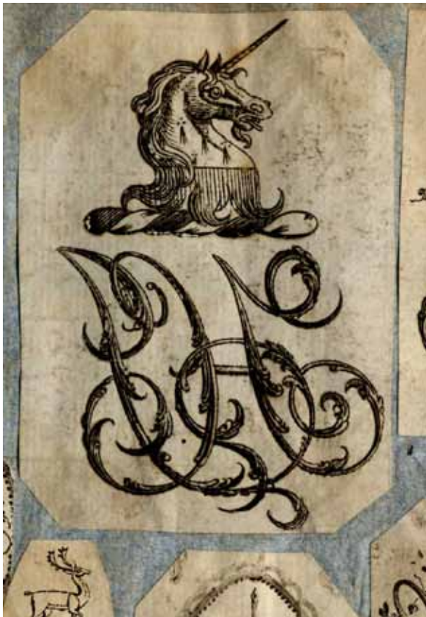
Page 178 of the Scrapbook, detail, showing a 'mirror-image' proof. Photographed 2013, courtesy of the family of Alan S. Angus.

Another item of silverware with close links to the Scrapbook is the Trotter tankard, in the collection of the Laing Art Gallery and also on display in Northern Spirit. Here we see the use of what is perhaps the most extensive part of the collection, the large number of heraldic designs which appear crammed onto many of the pages. These would have been used either for bookplates, or for engraving directly onto metalware, and their proliferation within the pages of the Scrapbook is the reason that the title 'Heraldry' was stamped on the loose leather cover made for it in the 19th century. The Trotter tankard was made for the Trotter family of Morpeth by John Langlands and John Robertson in 1780, and engraved by the Beilby-Bewick Workshop with the boar's crest of the Trotter family and the initials 'RMT'. The initials suggest it was probably made for the Rev. Robert Trotter, and one of Thomas Bewick's notebooks describes this engraving work being carried out on 30 December 1780. While there is no exact match in the Scrapbook for this design, there are very similar crests gathered on page 175, and designs for monograms and initials on pages 178-179. Interestingly, the prints for many of these initials are mirror-image, suggesting that they may have been 'proofs' taken off engraved objects – and also useful tools for training in copperplate engraving, where the plate had to be cut in reverse, to ensure the final printed image was the correct way around!