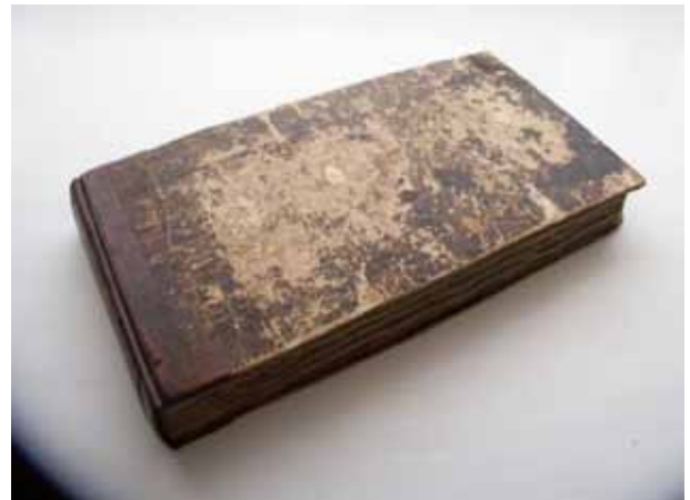
Figure 7. The completed book. The old spine leather was cleaned, trimmed and glued to the new leather spine, retaining the original appearance, including the retained old paper label.

of the boards). The leather was cut to size, and the edges pared to form a tapered edge to fit under the old strips without showing a ridge. The strips were carefully lifted from the edge; the new leather was dampened and pasted and then fitted neatly under the strips and pasted to the boards, first on one side and then, with careful adjustment to the correct width of the book, on the other. The upper and lower ends of the spine leather were folded under and the moist leather moulded to a neat shape (known as ‘setting the cap’). Once the completed case was dry it was fitted to the book block and the short end-paper hinges and tapes were fixed as described above. Finally, the preserved old free endpapers (flyleaves) were tipped into place, leaving the new hinges scarcely detectable.