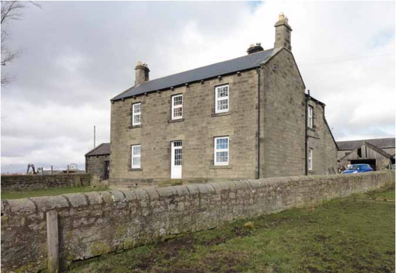
Breckney Hill farmhouse.