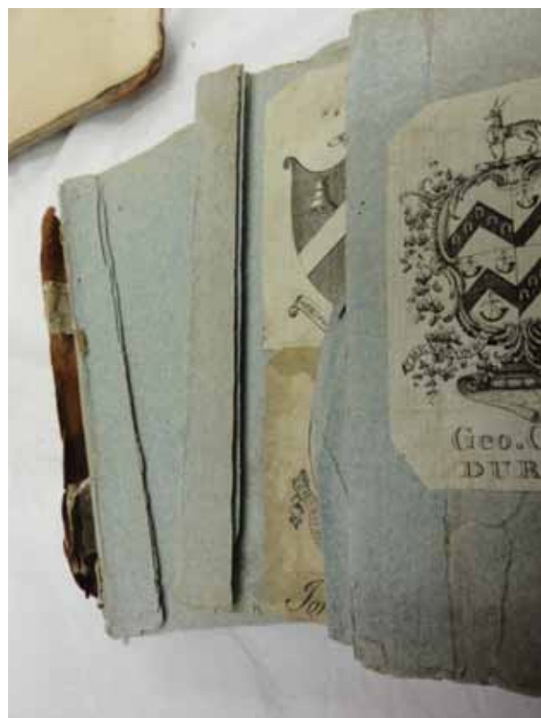
Figure 3. Loose pages showing the form of the guards, some of which were missing, and the remains of the vellum tapes or bands on which the pages had been sewn. These tapes and the old sewing thread were the only parts of the original structure that had to be discarded.