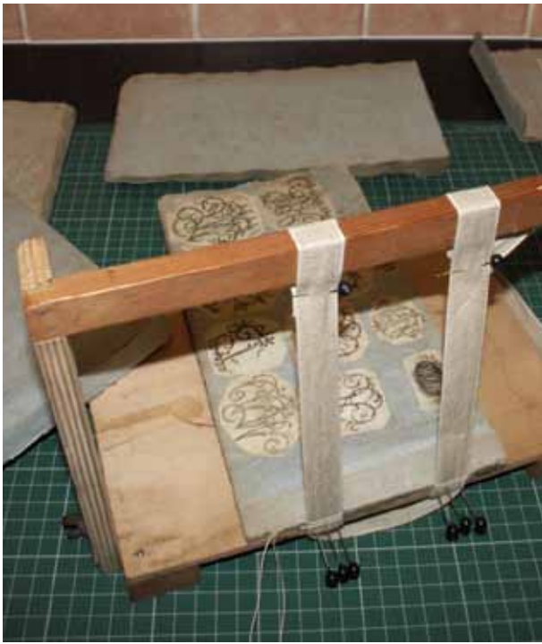
Figure 5. The numbered pages were carefully collated, with very sparing and minimal repairs to any minor damage. They were then sewn in order with linen thread onto archival grade tapes as shown, creating the ‘book block’.