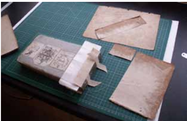
Figure 6. The book block with the tapes trimmed.

Two short white sheets, one shown on the surface, were sewn forming part of the block on each side. These took the place of the endpapers which would usually be attached here, and were made of a sheet of old white sugar bag paper chosen to match the old endpapers. At a later stage the inner edges of the paste-down endpapers were carefully lifted from the boards and size-adjusted parts of the short new papers, together with the ends of the tapes, were inserted under the paste-downs and pasted to the boards, forming a final strong connection between the book block and the ‘case’.