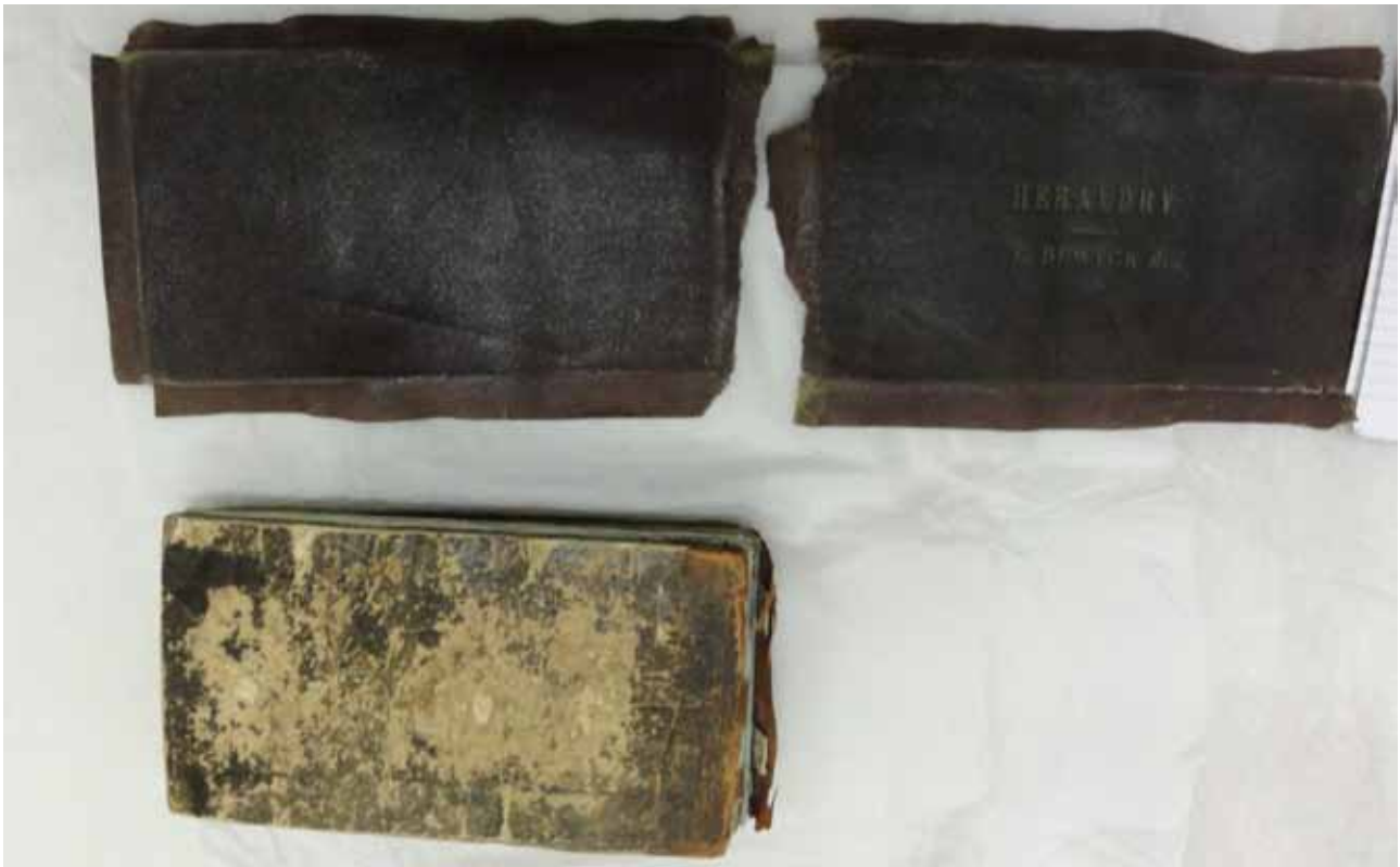
Figure 1. The book and two parts of the slip-cover before work began.

This issue of the Cherryburn Times focuses on the John Laws Scrapbook. Contributions detail Laws' life, work and ornithological interests; examine the Scrapbook and debate its possible history and link images in the Scrapbook to objects in the collection at the Laing Art Gallery.