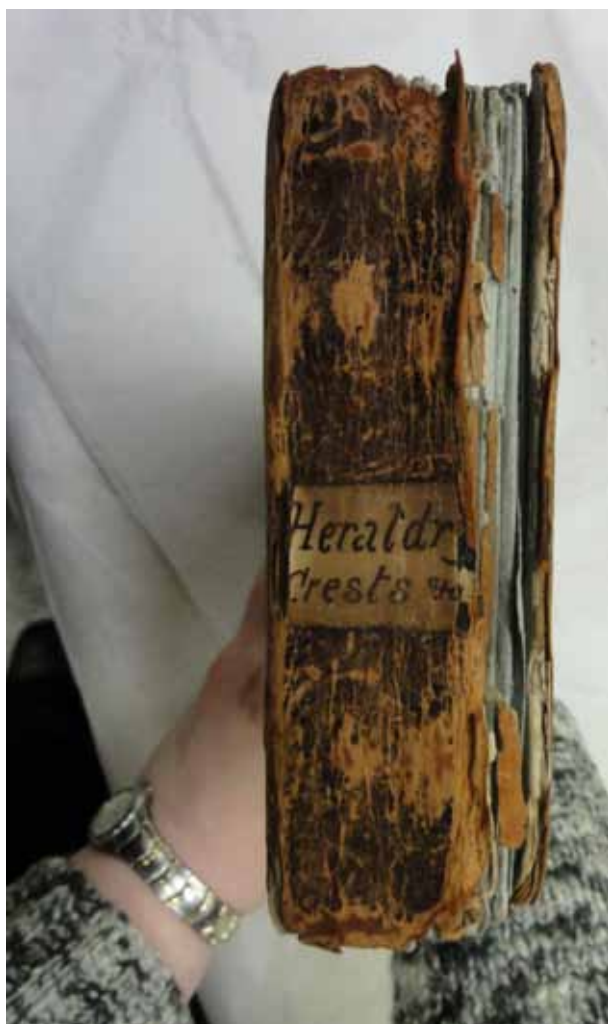
Figure 2. The partly detached spine. This was carefully removed and kept until the end of the work when it was cleaned and glued down onto the new leather spine.